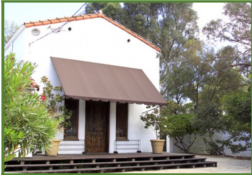
Rinzai-ji Zen Center 2505 South Cimarron St. Los Angeles, CA 90018